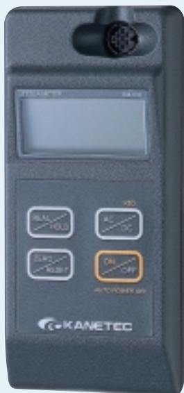
TM - 501